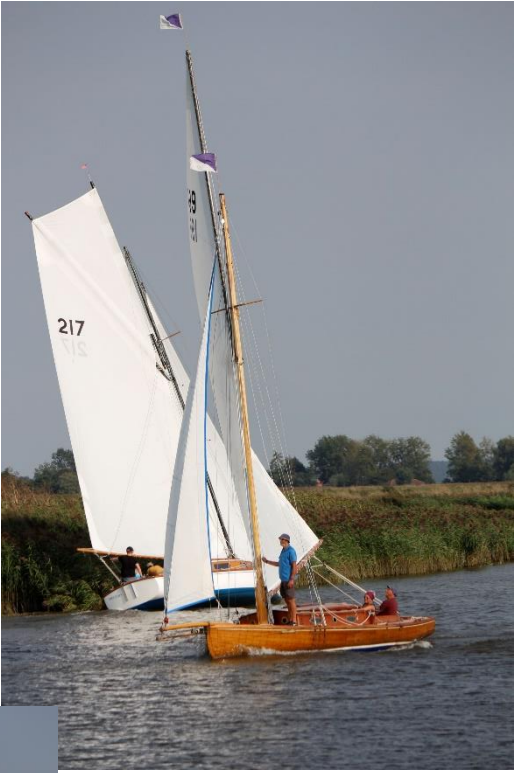
All Pics © Dave Durrant unless stated