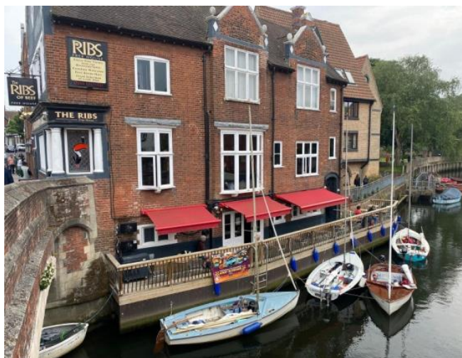
Wayfarers 'refuelling' in Norwich, full story next month.

Partnerships - Liaison with Tavern DT discussed request to Wellington for permission for City Fibre to lay cable along car park to allow Herons Marsh access to Broadband. Decision by Wellington awaited.