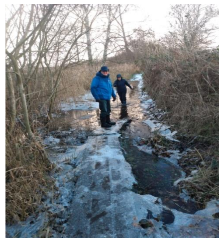
Whose idea was a Walk?

In the meantime, don't forget to check over your craft at the club and your kit at home.