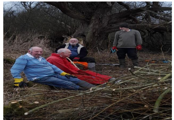
Time for a well-earned break and mardle.