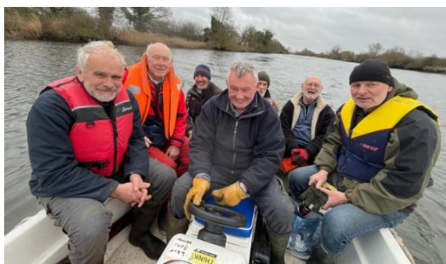
Tree cutting transport (who's singed his hair - on the left)