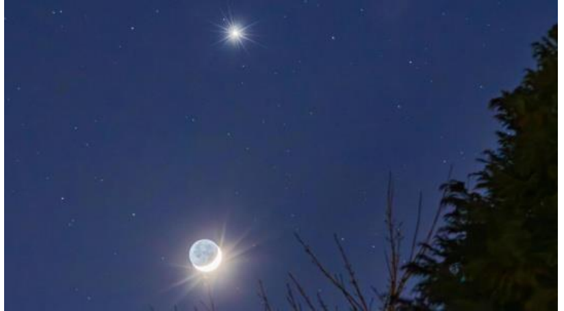
Crescent moon with Venus clearly above

February is the Snow Moon , named before climate change, this month we were able to see a Planetary Alignment also a planetary parade in the dark sky when six planets align to create a celestial spectacle, the planets include Venus, Jupiter and Saturn clear to the naked eye with Mars Uranus and Neptune in the line up, Mercury is set to join in at the end of the month.