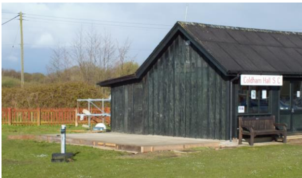
Clubhouse with 2006 rear storage being extended 2013

By 2005/6 it was realised that the clubhouse was becoming overused for the storage of equipment, sails etc. and was not able to be used comfortably. Also there was nowhere with privacy for changing into or out of sailing clothing or into dry clothing if somebody got wet. So, a rear storage area and changing room was designed and planning permission sort. With construction commencing in 2006. This new area, accessed by double doors cut through the back wall, enabled all the paraphernalia of sailing to be moved out of the main room/kitchen area into a purpose built storage area which included a changing room with sink.