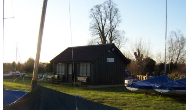
The original 2003 Clubhouse

In 2001 it was decided to build a new clubhouse on the edge of the dinghy park. Construction commenced in 2002 with the laying of the base and building of the new Clubhouse. The vast majority of the work being done by club members throughout 2002/3. On 26th April 2003 Commodore David Thrower officially cut the ribbon to open the club house. This single roomed wooden structure was now the new permanent HQ for Coldham Hall Sailing Club.