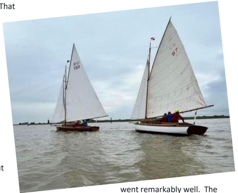
went remarkably well. The

By the time we left the mooring for the afternoon passage race to Reedham and back the rain was heavy and the wind cold. At the start the wind was not excessive and we made another good start. We held Catspaw behind us for part of the race but the wind picked up to a testing lumpy fresh breeze and she left us behind. Catspaw and Morning Calm had elected to start early and this proved to be the right call none of the later starters did well. At the soggy end of the race we had pipped Catspaw by a small margin on handicap putting her into second place overall. I was soaked to the skin.