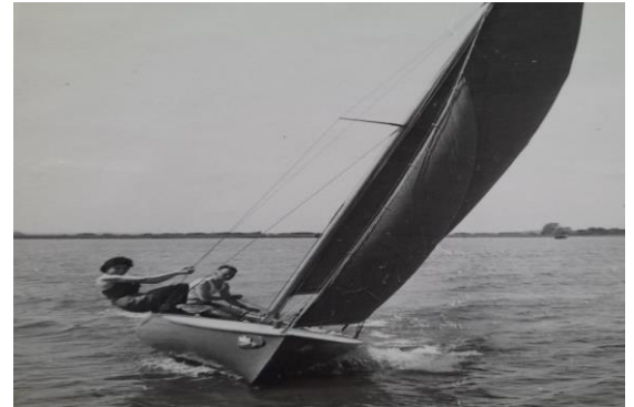
To Pegasus racing with June on the trapeze

During the Second World War allied aircraft flying to Germany suffered heavy losses, especially on their return journey over the North Sea. Shot down by enemy aircraft, severely damaged by anti-aircraft fire and loss of fuel being just some of the reasons that brought planes down into the sea. Ditched aircraft were far from home, out of the range of rescue, there were no helicopters, no Air Sea, Rescue as there is today, these guys were on their own. Rubber dinghies carried in the planes were difficult to get into and survive and frequently damaged as well as the aircraft. The problem was how to rescue these airmen and many lives were lost before a solution was found.