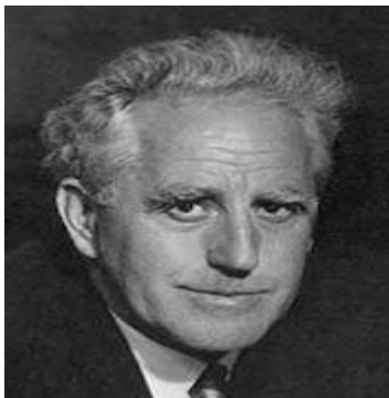
Uffa Fox 1898 - 1972

One answer came from Uffa Fox, a brilliant Yacht designer with an imaginative and persistent mind and with unorthodox methods. Uffa came up with a design which was eventually credited with saving many airmen’s lives. By the end of the war they had saved over 5000 aircrews lives around Britain.