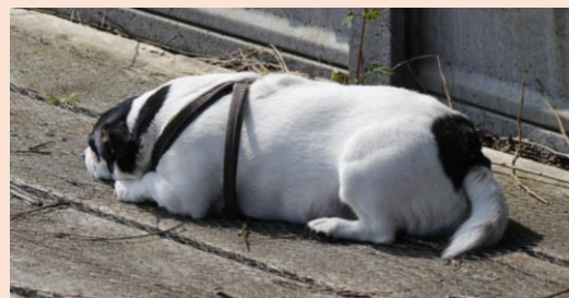
Not everybody finds the racing stimulating! 'Jenny' takes a nap.

A full list of all racing and social events is on the club website.